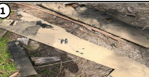
1 February 18 – An explosive UAV was launched from Syria toward Israel