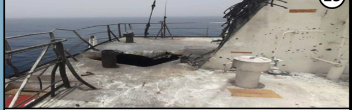
15 29/07/21 - The MERCER STREET vessel was hit by an explosive UAV