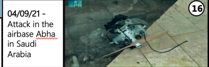
16 04/09/21 - Attack in the airbase Abha in Saudi Arabia