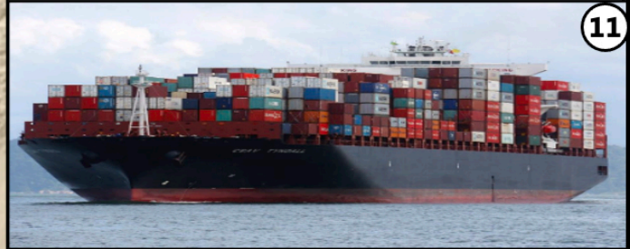
11 02/07/21 - CSAV TYNDALL vessel hit