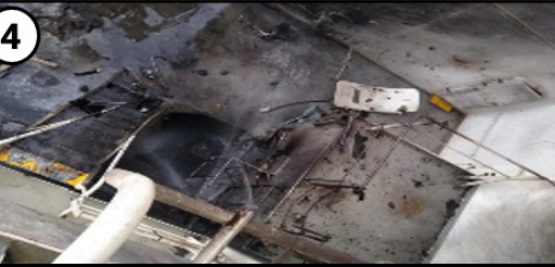
4 25/03/21 - LORI vessel attacked