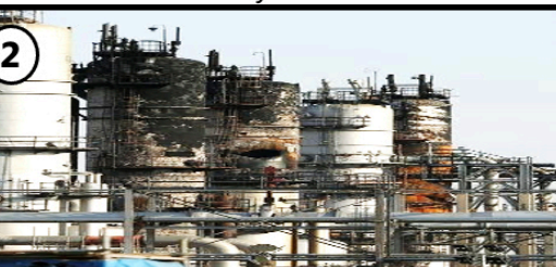
2 14/09/19 - Dozens of UAVs and cruise missiles hit ARAMCO facilities in Saudi Arabia